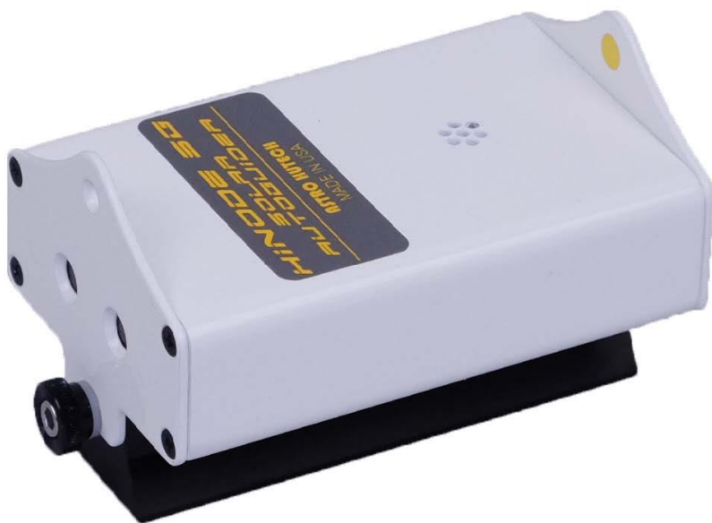
Illustration 2: Hinode guider installed on supplied mounting bar.